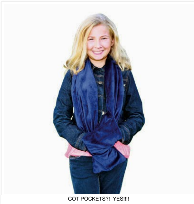
GOT POCKETS?! YES!!!!

Before moving onto the the review of the gorgeous product below, I want to take a moment to say how important it is to get a good grasp on really reading about sensory issues yourself. I think it will make you a better shopper of tools and more importantly, you will be able to see how you can modify things to make a better family and school environment for your child. That said, you are going to love this new thing I found.