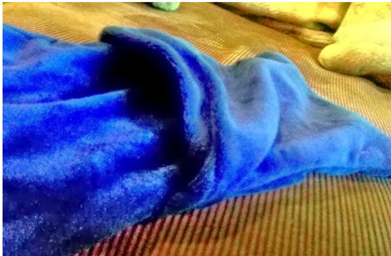
Inside the pocket one side is the smooth feel as the scarf material extends into the pocket and the other side within the pocket is a regular cloth texture.