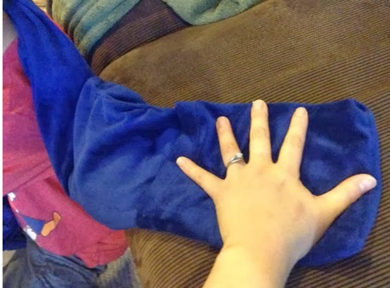
So you can see how large the pocket is...